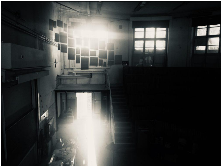
Auditorium of Rotting Sounds, 2019

Considering the difference between things (physical entities defined by its material properties) and objects (conceptual entities generated and perceived by semantically thinking) it is fundamental to ensure a certain legibility within the flow of time, which means to prevent that those entities are drifting too far apart. Consequently the maintenance, the controlled ›aging‹, appeared to reflect the individual artwork conceptually and its growing patina.