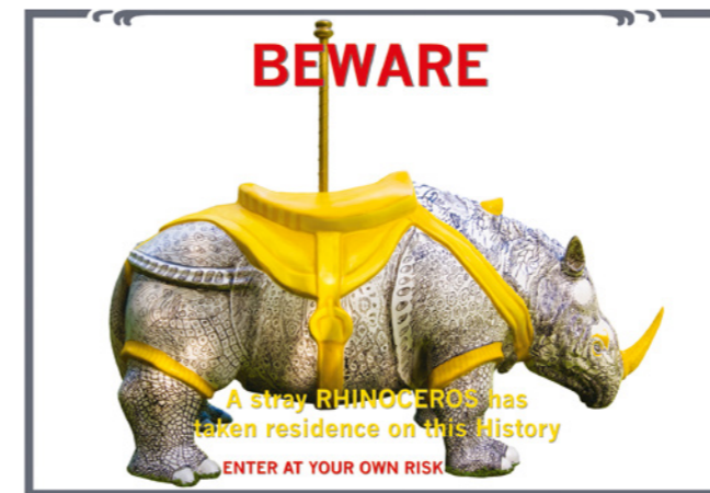
Raqs Media Collective: Beware , 2014, photo print on metallic paper

The interplay of lighting, acoustic ambience, juxtapositions, superimpositions, interpretive texts and notes in the margins produces breaks in linearity, continuity and chronology; the progression from station to station yields new insights into the art collections.