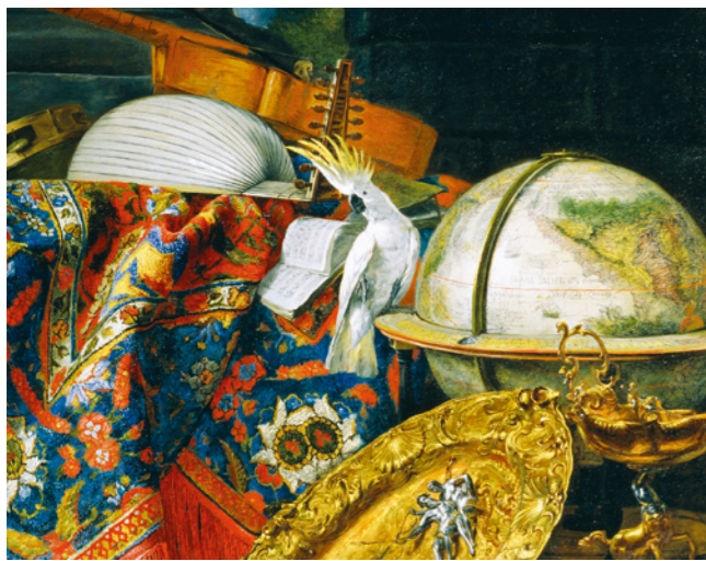
Pieter Boel: Still Life with Globe, Showpiece and Cockatoo , c. 1658, oil on canvas